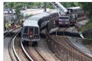
Investigators work at the site where two Metrorail trains collided with one another